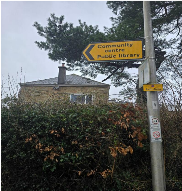
Signage mounted on a lamppost showing the way to the community centre and library.