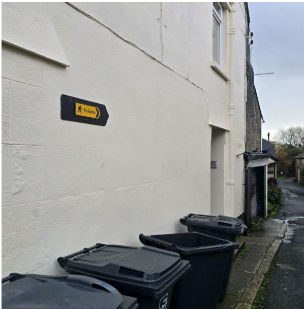
Signage on the charity shop wall indicating the way to the toilets.