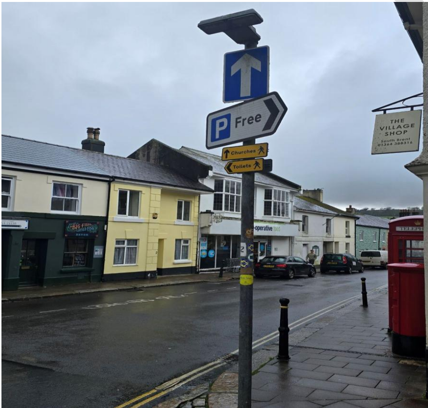
Lampost-mounted signage in the centre of the village pointing the way to the public toilets and churches.

To give you an idea of how this kind of signage can look in-situ, Four Rivers Dementia Alliance supported South Brent Parish Council with a signage audit and guidance. They have now installed dementia friendly signage around the village to indicate the way to key areas of it and this is shown in the next three photographs: